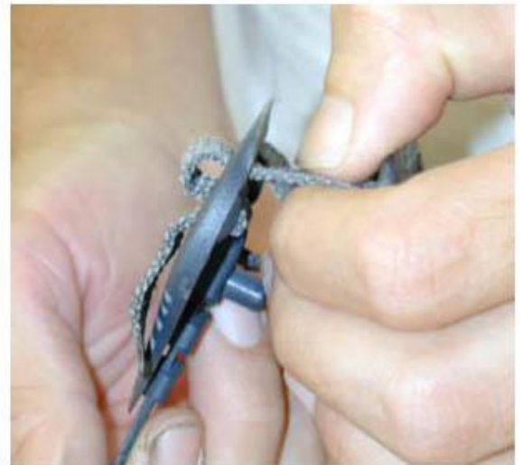
Adjust webbing length

The easiest way to re-adjust your camber back to a regular diameter setting is to use the batten tension key (found in a small pocket at the foot of your Ezzy Sail).