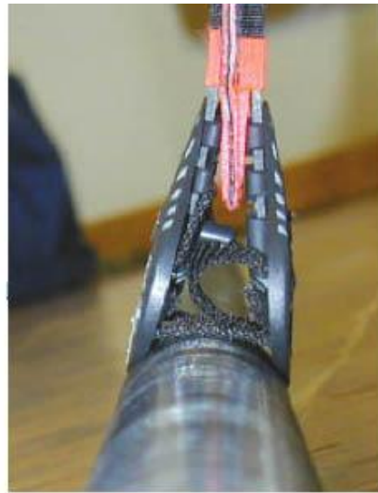
Camber arms seated correctly on mast