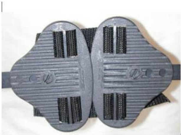
for skinny masts