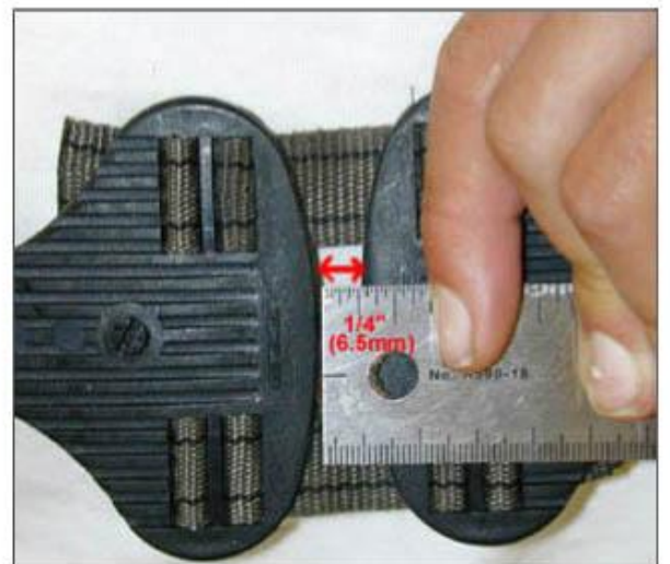
Standard diameter masts